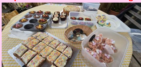
The cakes that were for sale!

Thank you to everyone who helped with the Easter fundraising the committee raised £105.31.